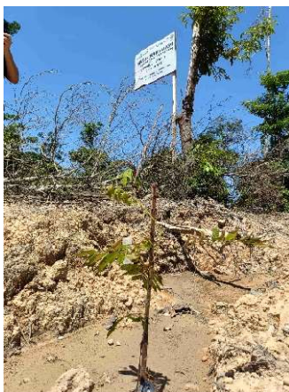
HH – North – Drilling area: Rehabilitation