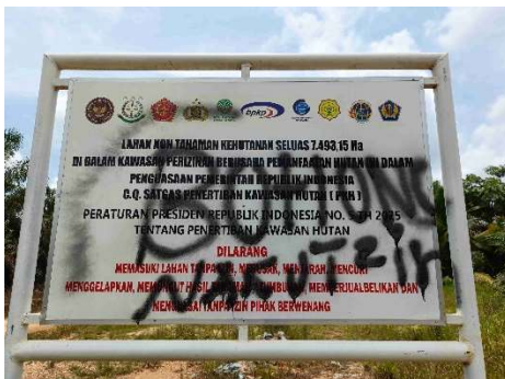
HH – Singboard Satgas PKH