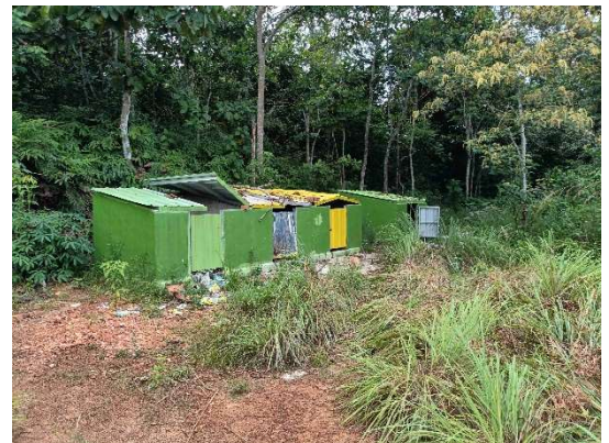
Camp: Waste Management