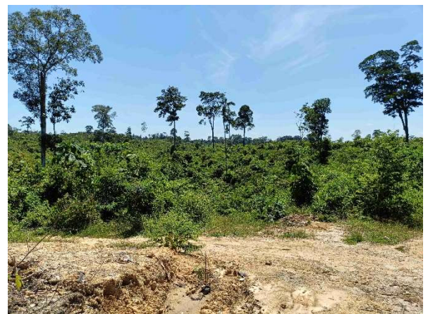
HH – North – Drilling area - Landscape