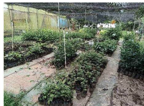
PT REKI - Nursery