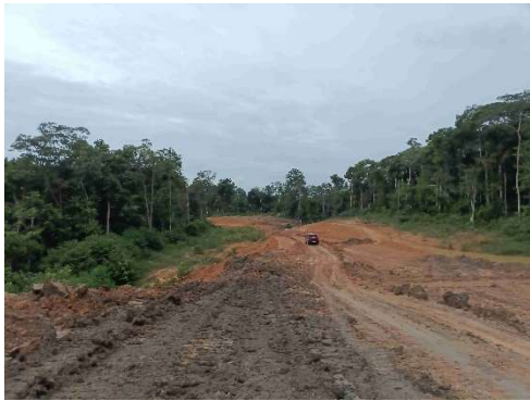
Coal Road, Fleet C (02.10.2025)